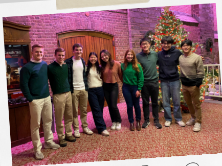
Christmas Jam @ McCarter